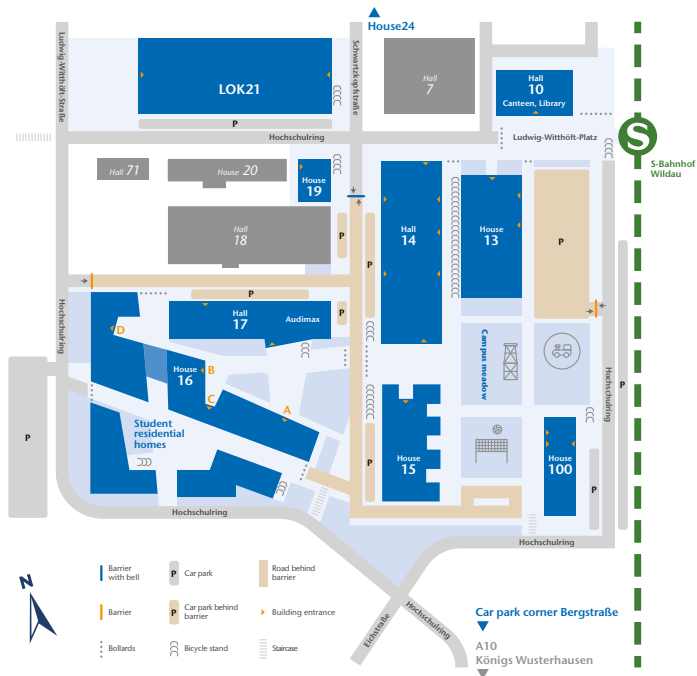
Interactive campus map: icampus.th-wildau.de/map Status: 04/2024